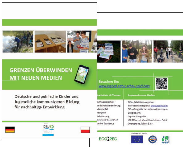
Booklet of the project "Crossing boundaries with New Media"

The offers are suitable for students aged 10 to 18 years. But they can also be used by families or interested tourists of all ages.