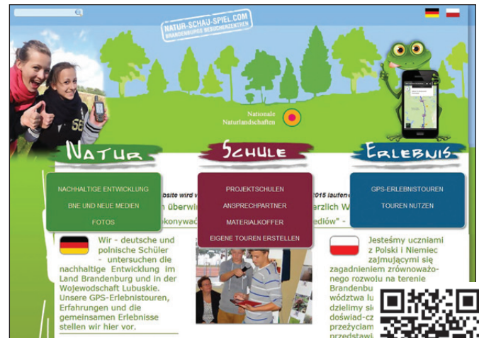
The German-Polish website www.jugend-natur-schau-spiel.com

The website provides instructional material ready to download for students and teachers on the topic "ESD and new media".